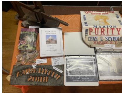
Wayne County Activity Books were given out.