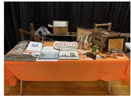
Historic items displayed.